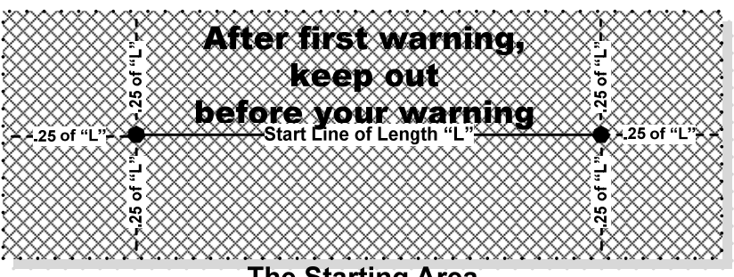
The Starting Area

After the first warning signal for a race and prior to her warning signal, a sailboat shall keep clear of the starting area that extends one-quarter of the length of the starting line ahead of and behind the starting line. It shall also extend one-quarter of the length of the starting line past either end of the starting line