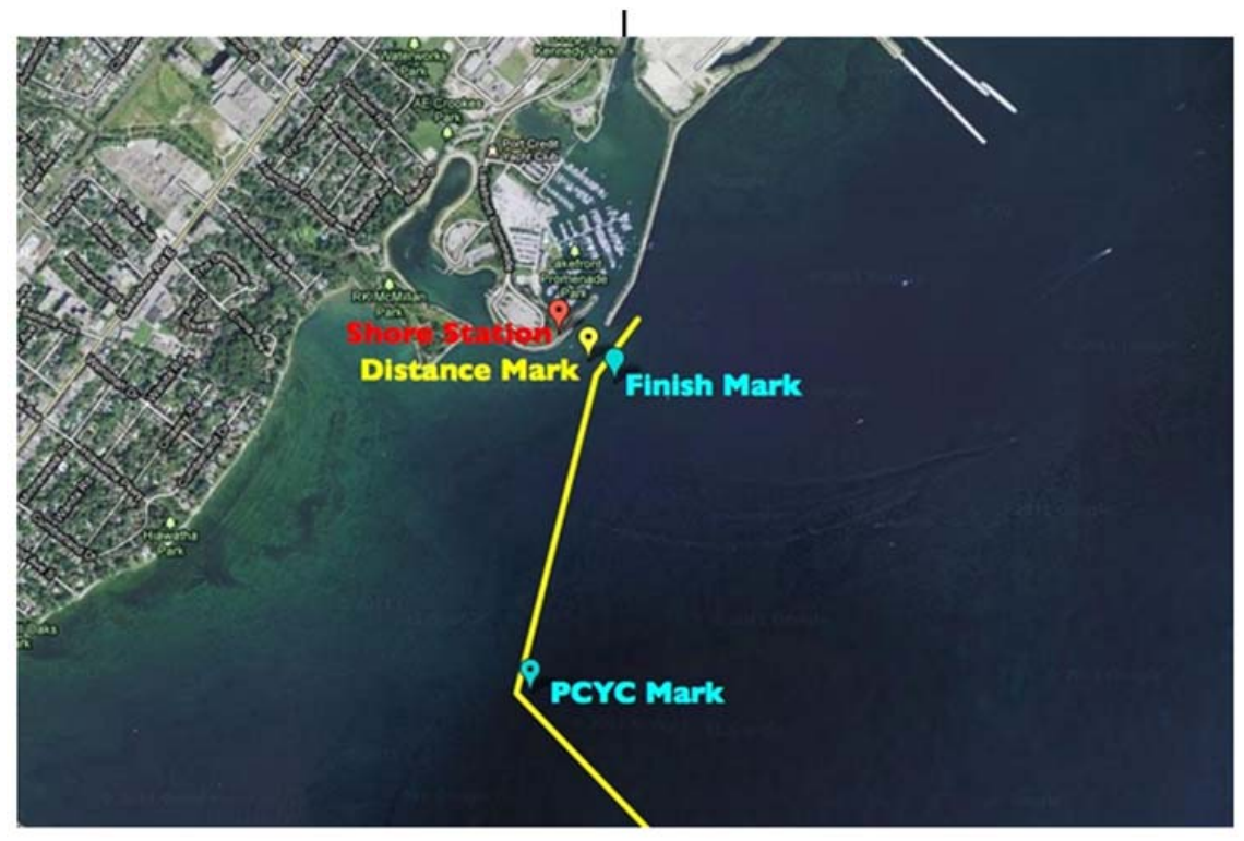
Diagram 2 The Finish

After the first warning signal for a race and prior to her warning signal, a sailboat shall keep clear of the starting area that extends one-quarter of the length of the starting line ahead of and behind the starting line. It shall also extend one-quarter of the length of the starting line past either end of the starting line